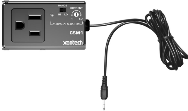
Figure 1 – CSM1 MRC44 Current Sense Module